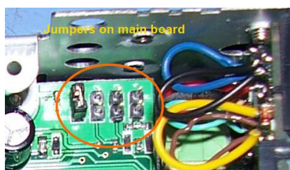
Jumpers on main board behind microphone socket

Radios are usually shipped in this mode. All functions and 24.5 to 29.9mhz continuous coverage. No jumpers.